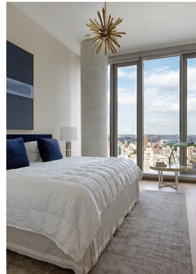
Rooms For Relaxing B&B Italia swivel chairs surround a game table from Interlude Home in a corner of the living area (OPPOSITE); the lamp is from Design Within Reach and the C-print is by Irene Mamiye. A guest room