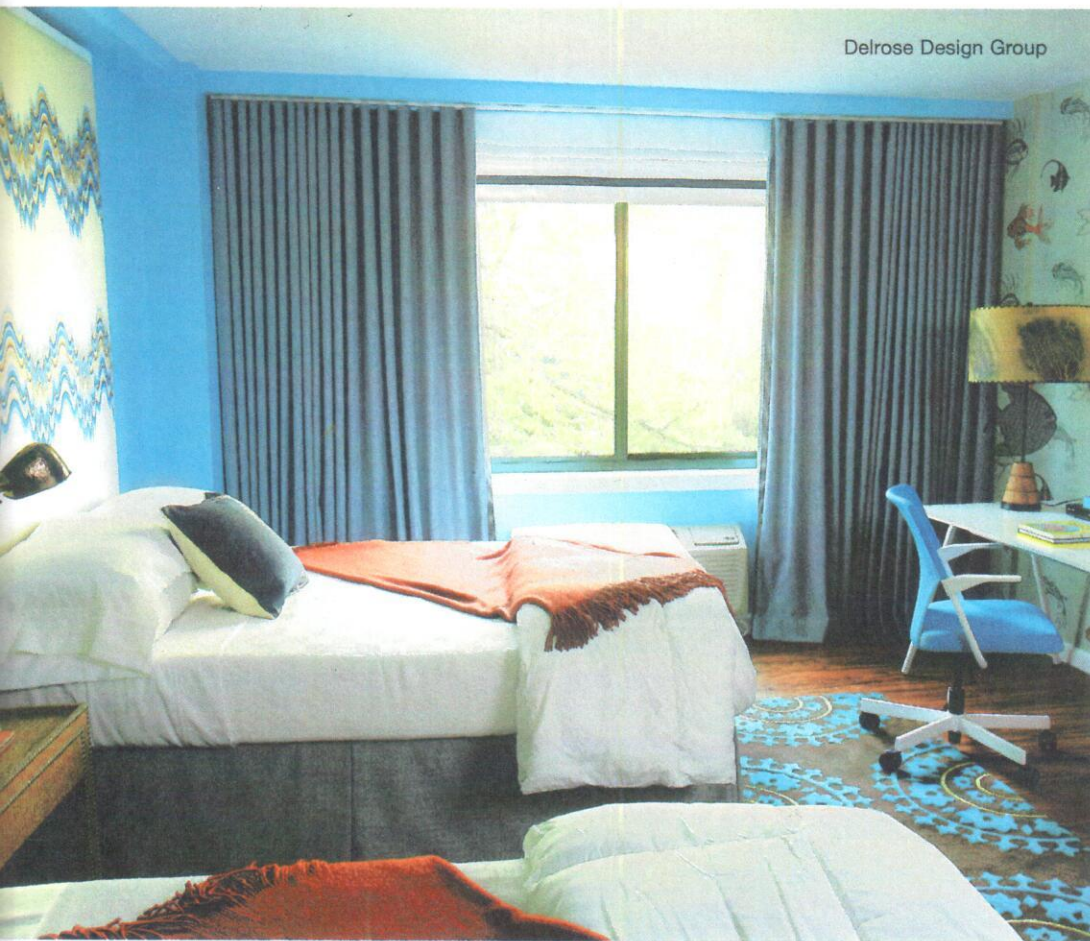
Delrose Design Group