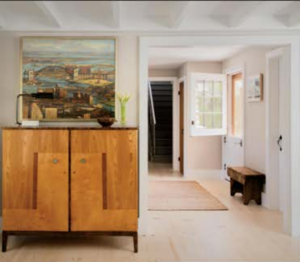
Big Harbor Style (opens in new tab) A painting by Thor S. White hangs above an antique Swedish console from Eileen Lane Antiques. A bed covering from Roma covers a bed by Ståhlroom in the primary bedroom. The nightstands are from Frimart Vintage, and the artwork above the bed is by Gavin Zeigler. In the primary bath, the tub is from Duravit and the tub hardware is from Waterworks.