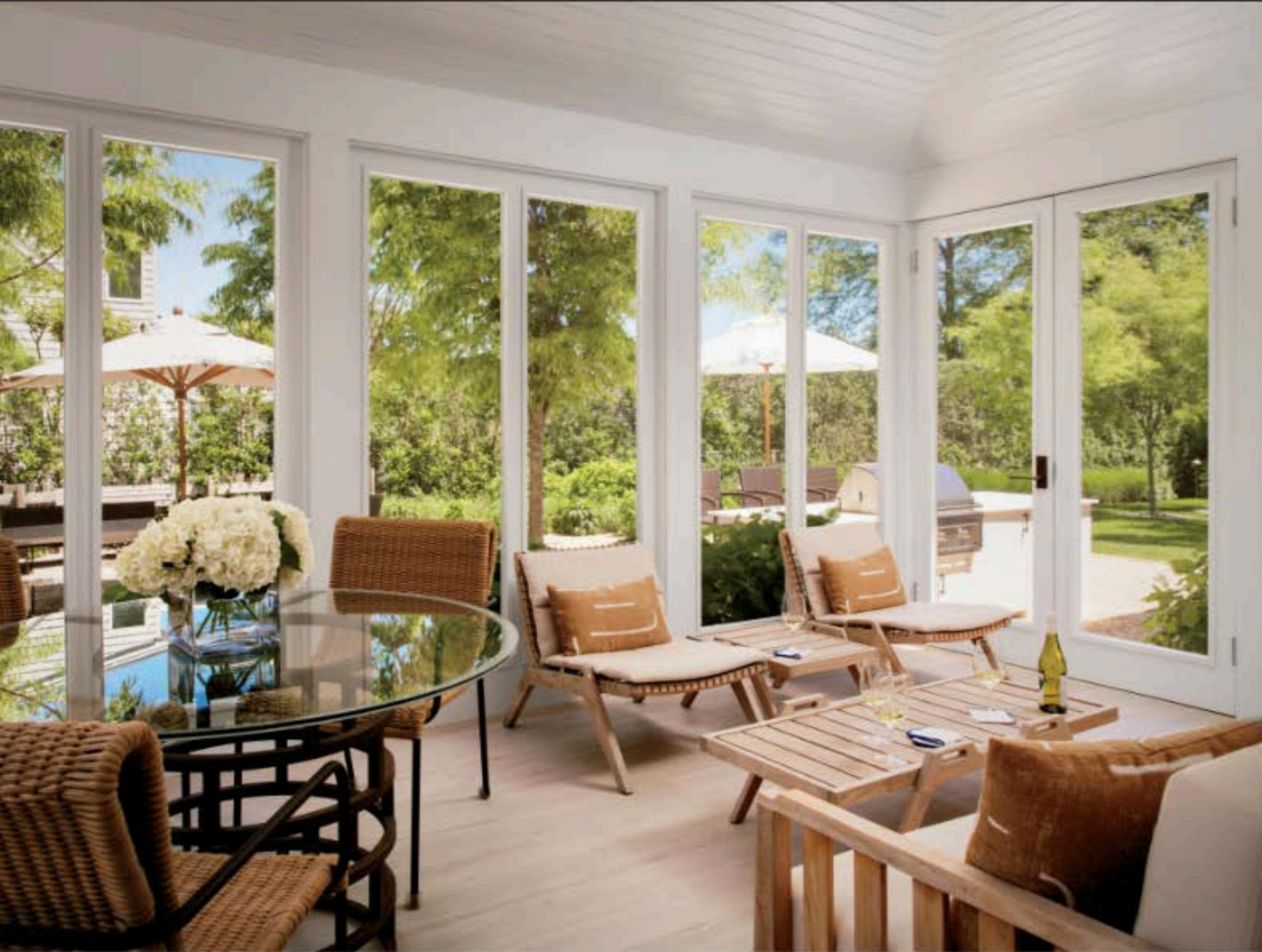
Natural Territory in the sunroom, the coffee table and lounge chairs are from William Wicker.

Peter Anton artwork. To add even more edginess to the room, though, he used cowhide for dining chairs that he grouped at a black powder-coated Saarinen table.